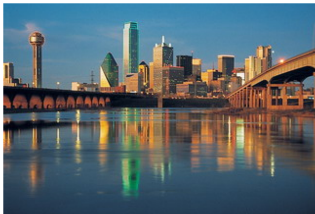
The Dallas Skyline, Viewed Here From Across The Trinity River

APEC 2006 2025 M Street, NW, Suite 800 Washington DC 20046 USA Telephone: +1-202-973-8664 Facsimile: +1-202-331-0111 Email: apec@apec-conf.org