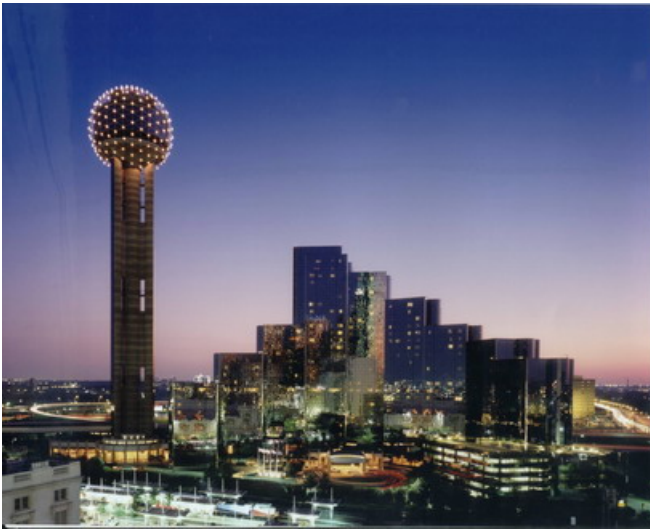
The Hyatt Regency Dallas, with the Reunion Tower, is an unmistakable landmark