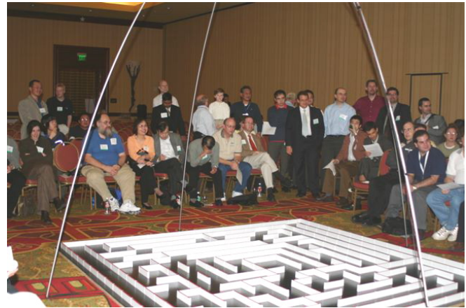
The APEC 2005 MicroMouse Contest

These are the topics that will be debated at the APEC 2006 Rap Sessions. No matter your job title, there is something for you in any of these sessions. The hardest part about the APEC 2006 Rap Sessions could well be deciding which one to attend!